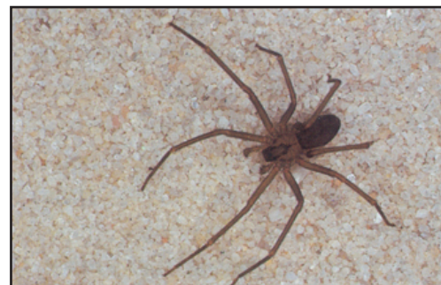
BROWN RECLUSE SPIDER

Despite sensationalist news headlines, there are no populations of brown recluse spiders in Western Exterminator Company's service areas. Medical journals such as The Public's Health and the University of California have recently published articles cautioning medical professionals and urging them not to be so quick to blame spiders for skin lesions and swelling. Conditions that can cause necrotic wounds and/or that have been misdiagnosed as brown recluse spider bites include: infections with Staphylococcus or Streptococcus species, Herpes Simplex, diabetic ulcer, Lyme Disease, fungal infection, poison ivy/oak, dermatitis, and others.